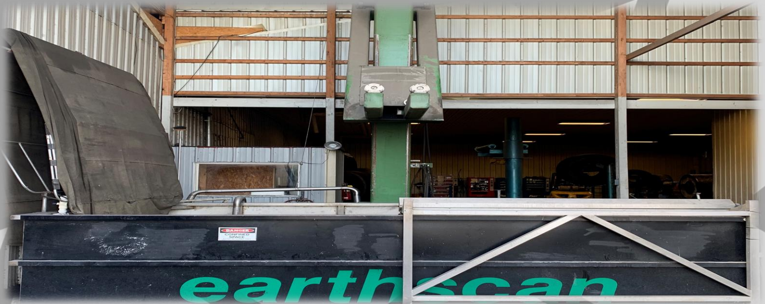
Tire in the process of being scanned