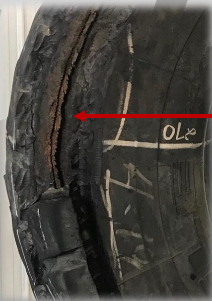
Separation in tire (after being cut out)